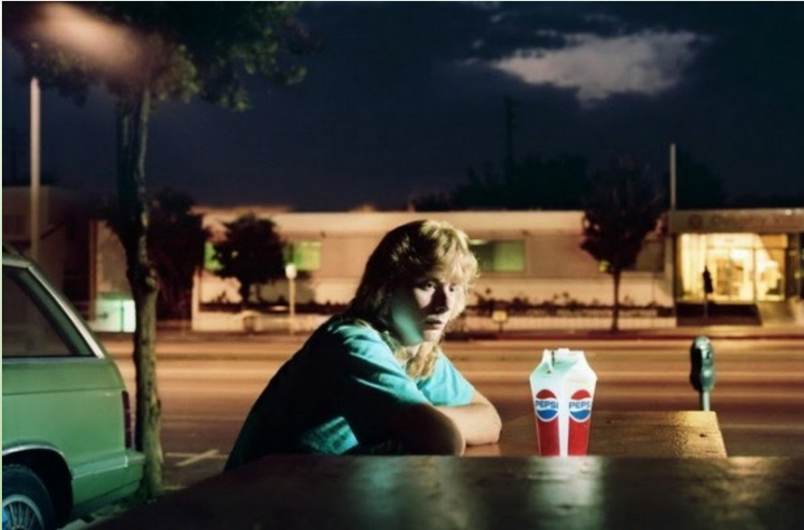
Philip Lorca Di Corcia